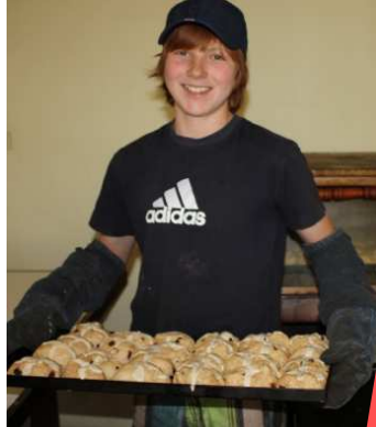
Baking 80 Hot Cross Buns on Good Friday