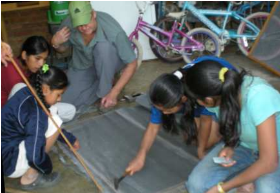
Mending mosquito nets