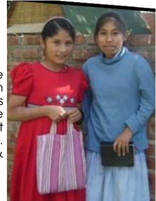
Off to church

Although we had arranged appropriate visas in NZ these were not approved on arrival .Obtaining the correct visas continues to be a long, difficult and now expensive process. The bureaucracy to obtain the right documents is challenging with many delays. We are developing patience & perseverance!